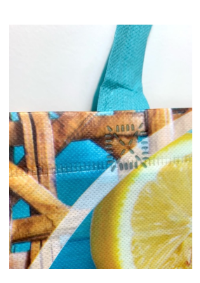
Closure with ultrassonic welding process