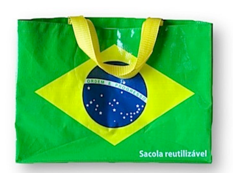
AVL5 e AVBB1

MATERIAL: LAMINATED PP WOVEN SIZE: L-45 x H-35 x Gusset-20 cm L-48 x H-33 x Gusset-18 cm HANDLE: PP webbing - L-52 x W-3,5 cm L-45 x W-4 cm