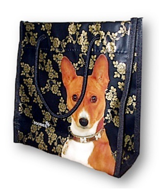
AVL4 – Vert e M2

MATERIAL: Laminated PET SIZE: L-33 x H-39 x Gusset-18 cm L-39 x H-34 x Gusset 18 cm HANDLE: PP webbing - L-50 x W-3 cm