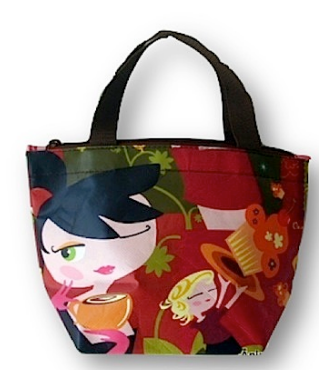
WFO02 - P e Q

MATERIAL: laminated PET SIZE: L-42 x H-30 x Gusset-15 cm L-40 x H-35 x Gusset-20 cm FINISHES: metal aspect and handle semi sewn