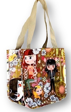
AVL3 – M1 e P3

MATERIAL: LAMINATED PP WOVEN SIZE: L-35 x H-40 x Gusset-20 cm L-32 x H-32 x Gusset 20 cm HANDLE: PP webbing – rounded corner