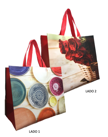
AVL05 MATERIAL: LAMINATED PP NON-WOVEN SIZE- L 48 x H-33 x Gusset-18 cm