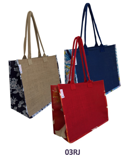
MATERIAL: 100% Natural JUTE e LAMINATED PP WOVEN SIZE: L-40 x H-36 x Gusset-18 cm HANDLE: Cotton rope with « X » stiching