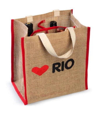
JJU5 MATERIAL: 100% Natural JUTE SIZE: L-33 x H-39 x Gusset-15 cm HANDLE: Cotton strip 55 cm